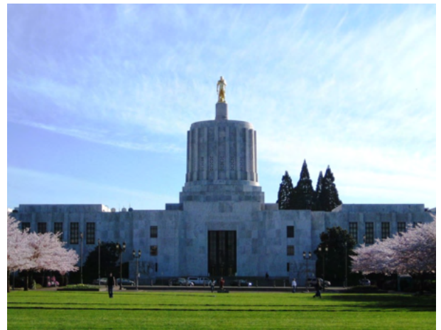
Oregon State Capitol Building Salem, Ore.